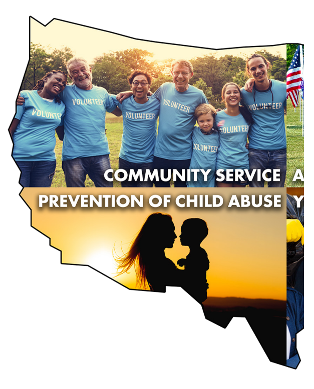
Commitment to Country was born in the aftermath of World War II, a time of unquenchable patriotism. Exchange Club members are proud to join veterans and other civic groups in promoting Americanism as the rich blessing of democracy and freedom. Members also educate today's youth to cherish these values.

Commitment to the Community is the focal point for each Exchange Club's efforts. Exchange is unique, as clubs have the flexibility to structure projects targeting needs of their communities, rather than being tied to a certain cause.